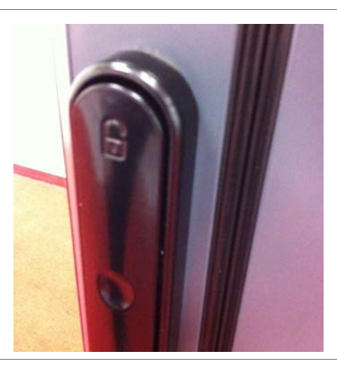
Ensure the 'unlocked' symbol is at the top before opening doors