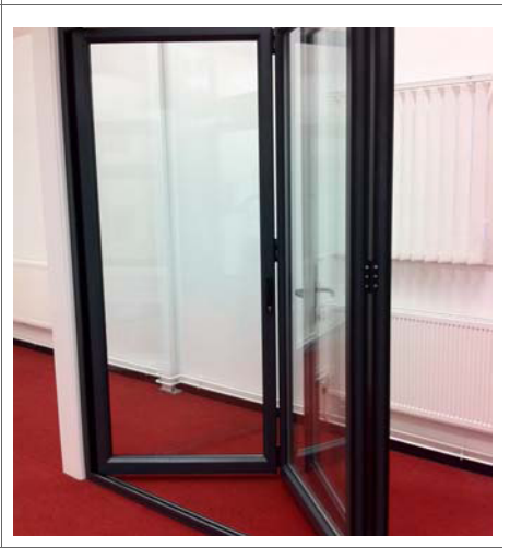
Slide panels together