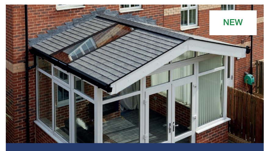
EQUINOX VEGA - GLAZED SOLUTIONS