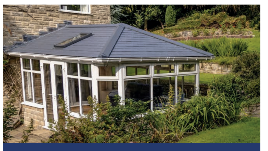
EQUINOX - SOLID TILED ROOF SOLUTIONS

Or alternatively, our innovative new Equinox Vega glazed solid tiled roof to invite the maximum amount of daylight into your new living space.